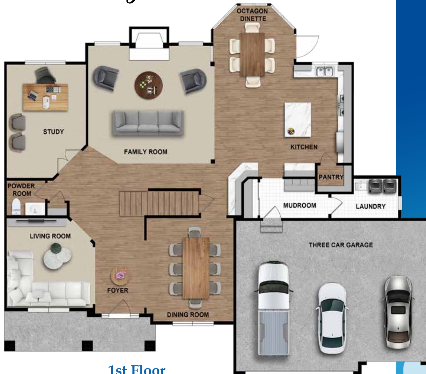
1st Floor 1872 Sq. ft.

"Faganel Builders is a full Custom Homebuilder and all Elevation Styles are interchangeable with all Plans. Ask your Sales Representative for ideas on Custom Elevation Changes that are available."