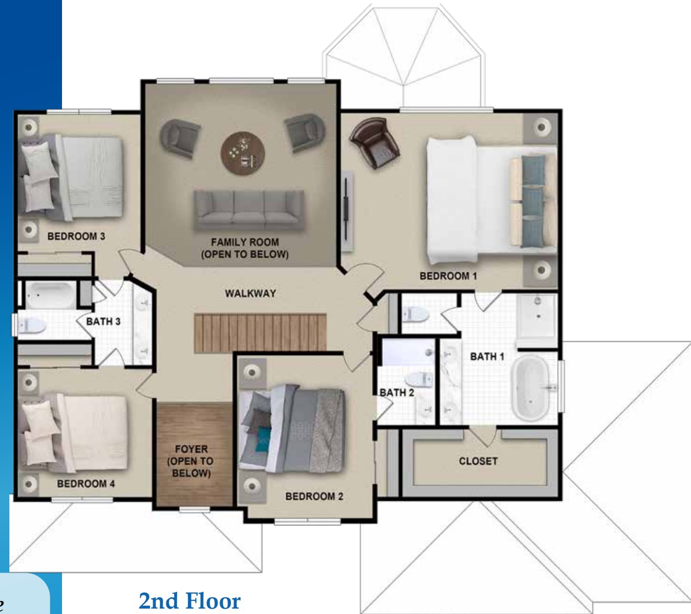
2nd Floor 1659 Sq. ft.